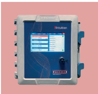
▲ "Intuition-9": Unparalleled versatility in water treatment.