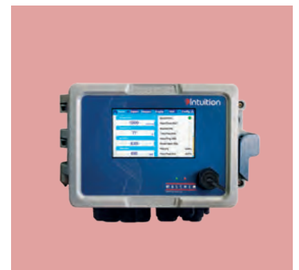
▲ "Intuition-6": Reliability and flexibility for water conditioning.